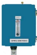
Simple Dew Part Number 13134

Requires 24 VDC Power Retransmits DP process variable (0 - 1 VDC) Dew Point range: 0 - 80 °F.