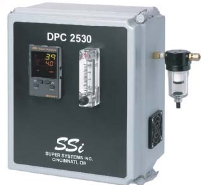
DPC2530 - Continuous Part Number 13118

The DPC2530 supports Modbus RTU communications enabling the user to datalog the process variable.