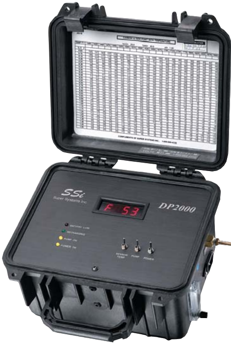
DP2000 - Portable Part Number 13070

The Model DP2000 is the most popular replacement for the analog dew point analyzers in the heat treat industry. Its digital display has taken the guess work out of measuring the dew point in endothermic and exothermic generators, atmosphere heat treating furnaces and tin-baths in the glass industry.