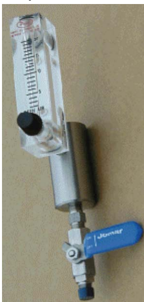
PN 13123 Remote Mounting Assembly

For best results, the sensor should be mounted directly in the measured gas line. This will ensure that it remains in a low-dew atmosphere which will decrease the measurement response time. The sensor is fitted with 5/8-18 UNF Male threads. If the sensor is not going to be mounted directly in the gas stream, it should be installed in the Remote Mounting Assembly (SSi Part Number 13123), which can be purchased separately. Although this installation does allow for some design flexibility, it is important that only stainless steel tubing and fittings are used to carry the sample gas to the sensor. When installing the unit, verify that all fittings are tight, since any leaks will cause inaccurate readings.