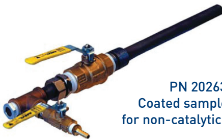
PN 20263 Coated sample tube for non-catalytic reaction